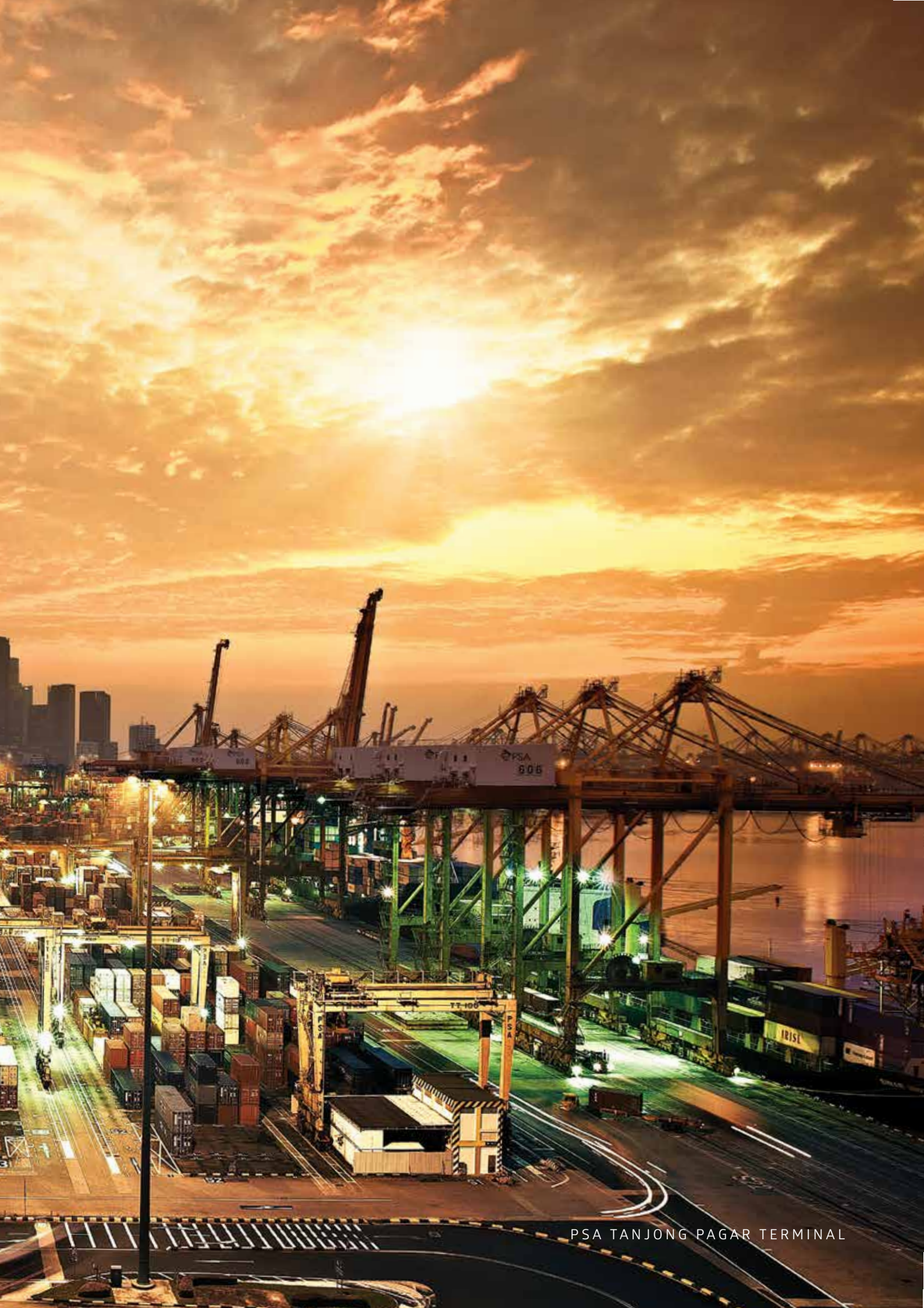
PSA TANJONG PAGAR TERMINAL