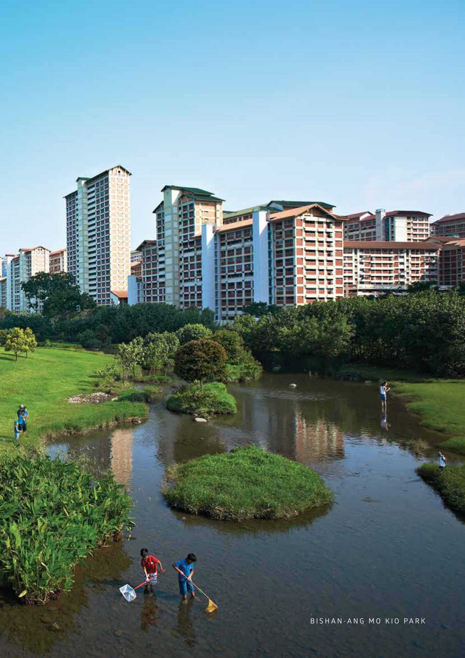
BISHAN-ANG MO KIO PARK